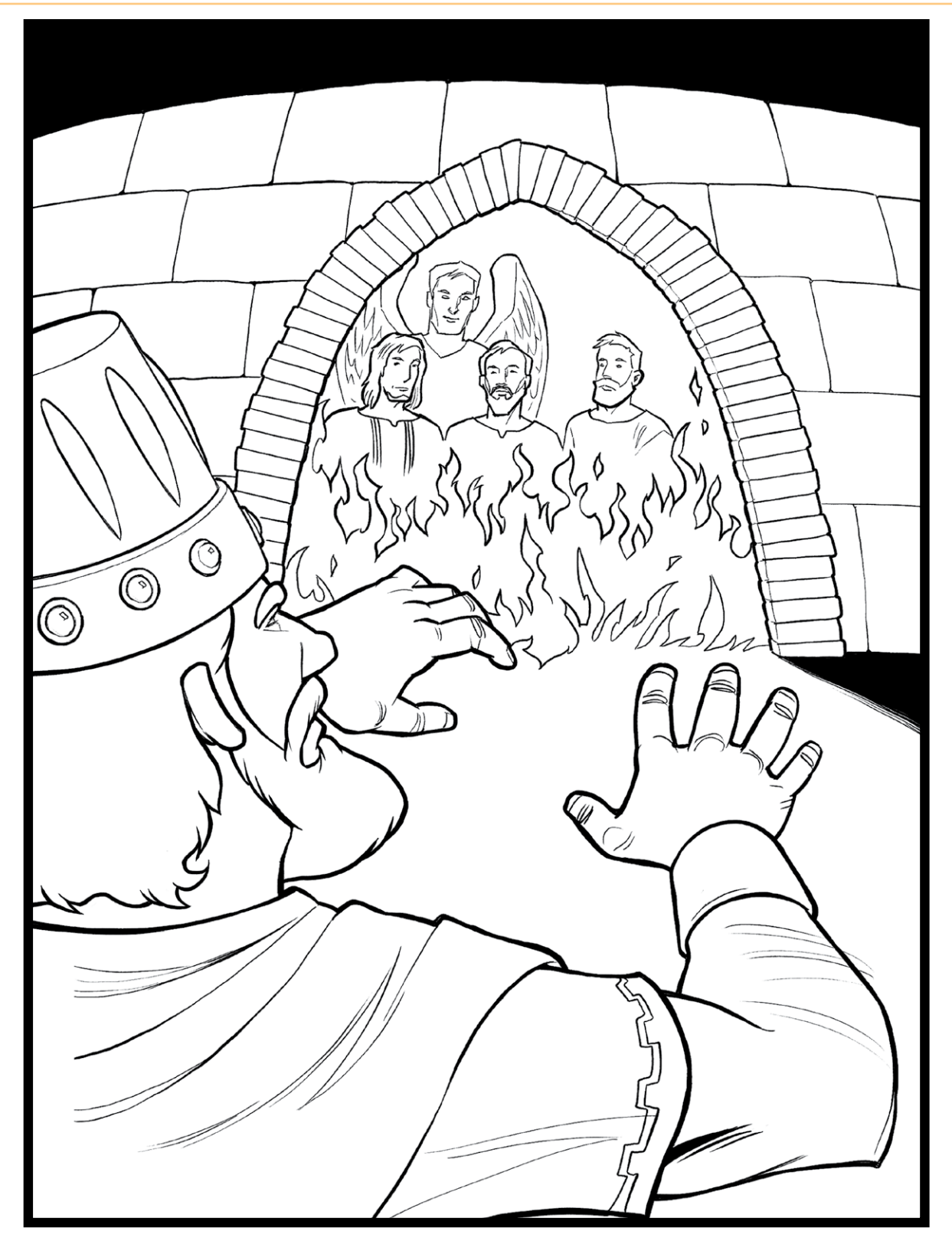
The Fiery Furnace: Daniel 3 Key Idea: I dedicate my life to God's plan.

This illustration shows the courageous men with an angel in the fiery furnace.